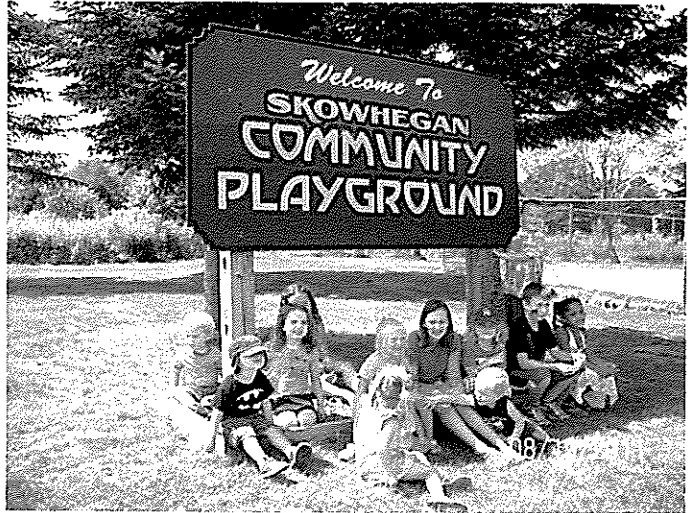
A group takes a rest at the "End of Summer" Reading Program.

School's back in session and that means that things in the children's library slow back down a little, but we still have plenty of fun in store. Don't forget about our weekly Story Time every Wednesday at 10:00, our Toddler Time every second and fourth Monday at 10:30 and our Family Story Hours every third Tuesday of the month at 4:30. If you like our Facebook page, you can easily follow along with all of the things we have going on!