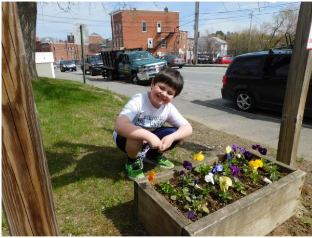
A young visitor stopped to admire the pansies recently on his way into the Library *****