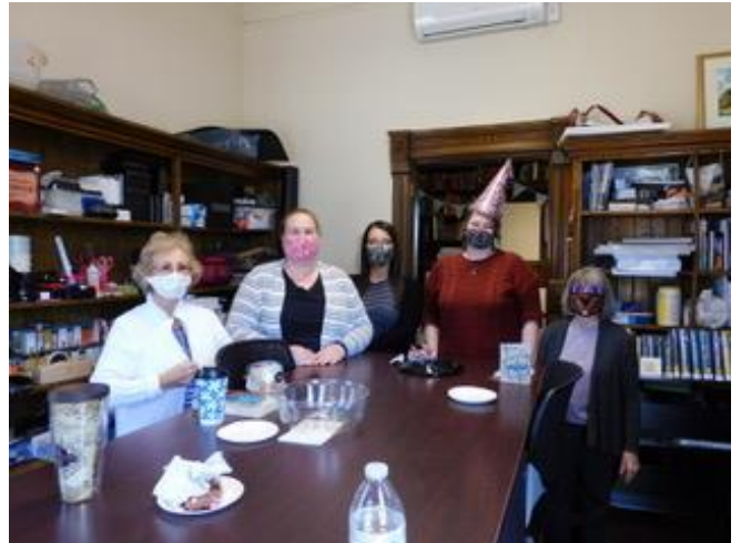
The staff takes time to celebrate two recent birthdays during their lunch hour

Watch for more information soon! A "Library Tea Party" is being planned for later in the Spring, to be held at the store!