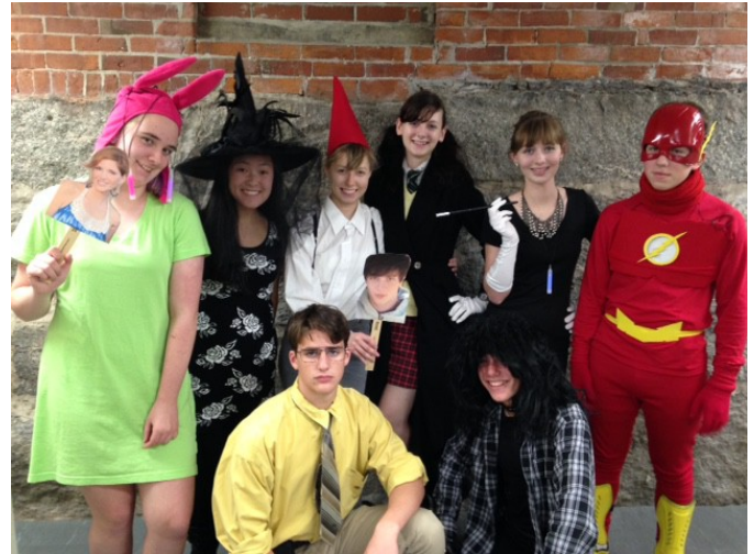
High Schoolers at the October Teen Regression Session - all ready for Halloween

Next month's Family Story Hour, however, is going to be a real "hairy" adventure and I "mustache" you to be ready for a silly story or two. So "shave" the date-- November 15th at 4:30!