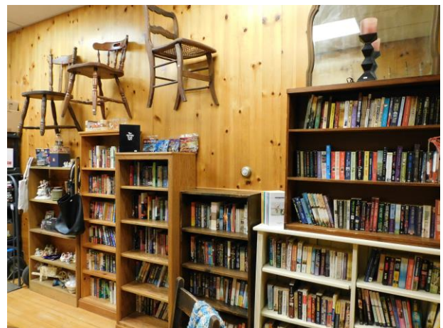
Be sure to shop the new Book Room at the Library Store!