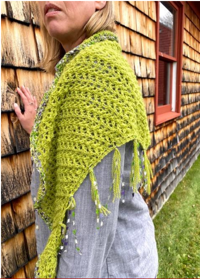
Shawl $20 by Pat Dickey

To purchase any of these items please call Pat Dickey at 431-2328