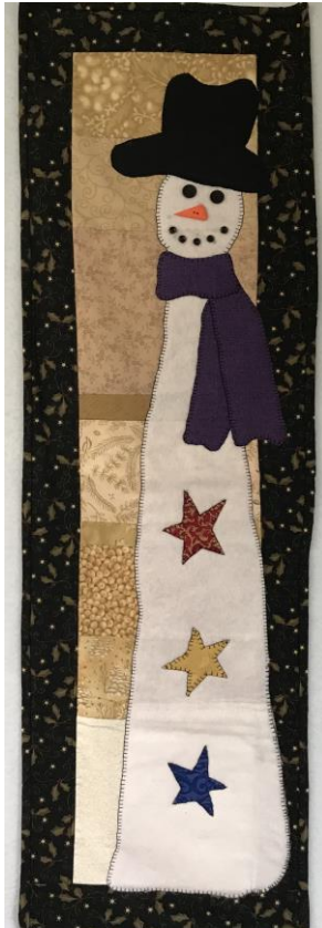
Snowman Wallhanging (10" x 35") $25 by Lynn Perry