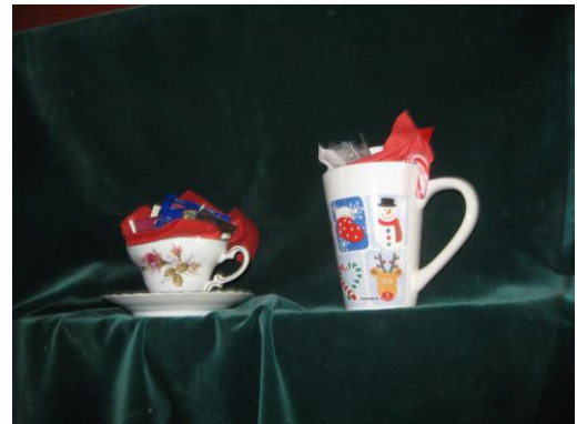
Mugs and Teacups filled with holiday treats $5 each by Bazaar Committee