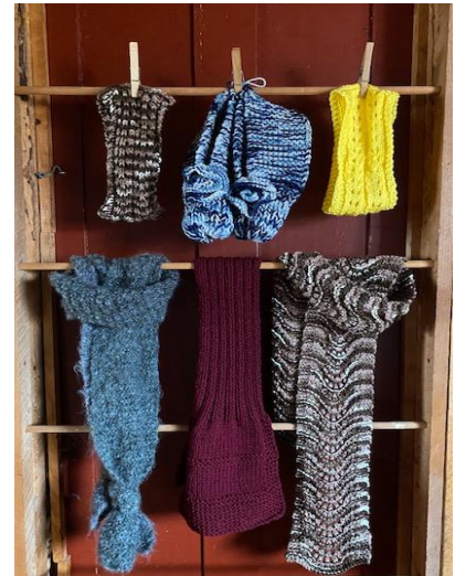
Scarves $8, Slippers $7, Headbands $5 by Pat Dickey