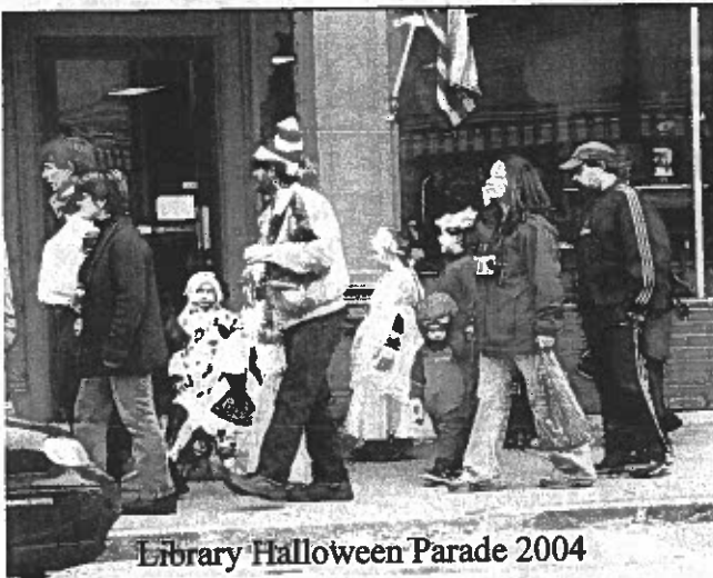
Library Halloween Parade 2004

Last January's Teacher's Reception was such a success, that the Library is going to do it again, tentatively on Thursday, January 13th. This time, Middle School and High School teachers will be invited as well as the Elementary School teachers. Wine and cheese will be served by Friends of the Library again this year. There will be free chair massages and free Reiki sessions for the teachers. We will also be offering information on possible field trips within a twenty mile radius of Skowhegan.