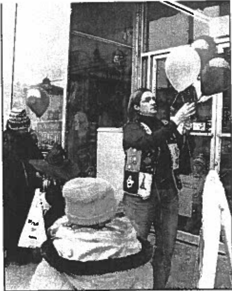
Balloons for the kids in the Halloween Parade.