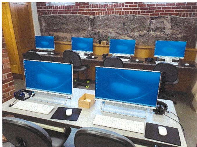
All new computers in the computer lab!