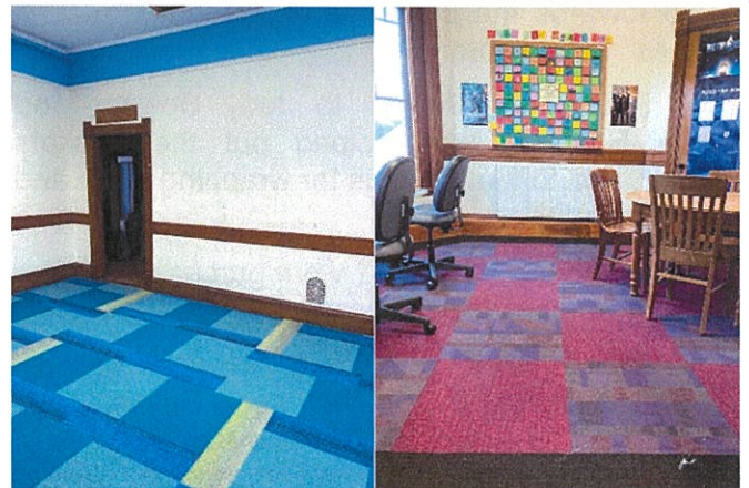
The fun new carpeting in the children's and teen's rooms