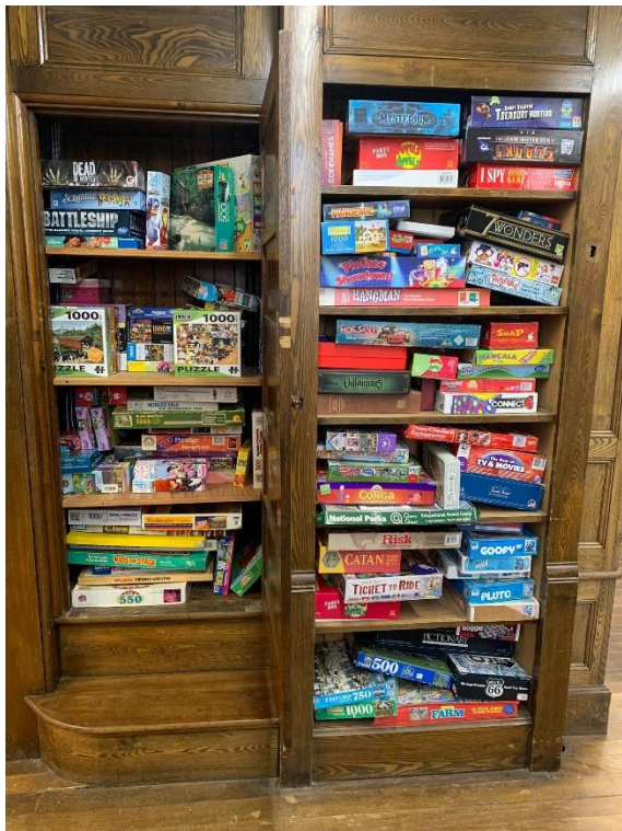
Our collection of puzzles and board games

As we head back into the dark, cold winter months we all have to endure here in Maine, we want families to remember that the library offers more than just books. We have movies for all ages and interests, games for the family, a ton of puzzles, and even some Nature Explorer Backpacks. All of these items can be checked out from the library just like books are.