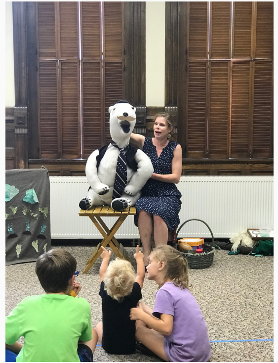
Some of the many fun events in our last month of the Summer Reading Program!