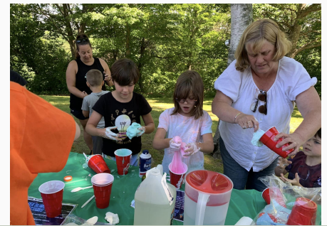
Some of last year's 2022 Summer Reading Program fun!