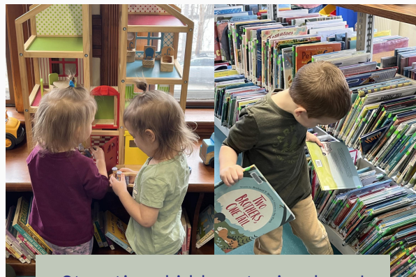
Storytime kiddos staying busy!

As many of our regular attendees may have noticed lately, our weekly Wednesday storytimes are becoming quite popular, to the point of everybody being packed in like sardines. Now, this is not what we would consider a bad problem to have, but it is a problem that requires a solution!