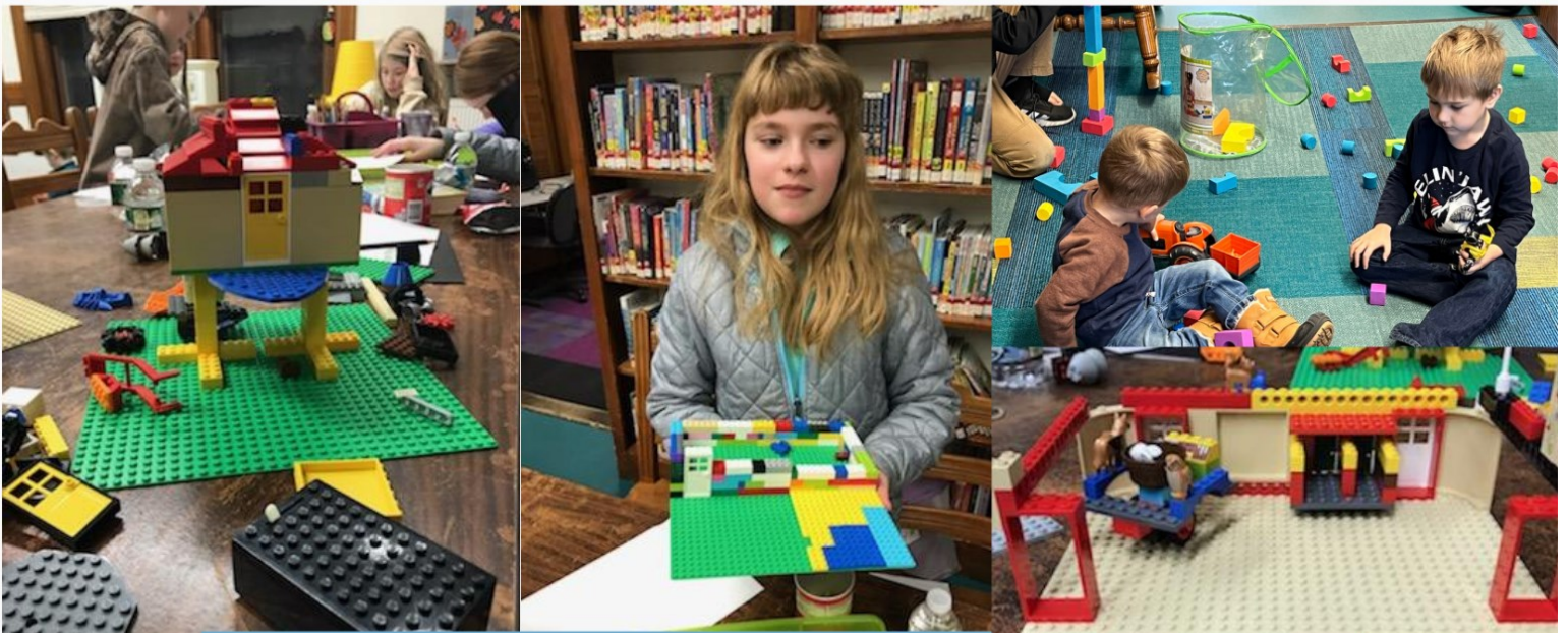
Lego club members building some amazing structures, we even had a Baba Yaga house!