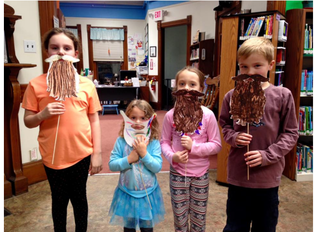
November's "No-Shave" Family Story Hour participants having fun with their craft projects.