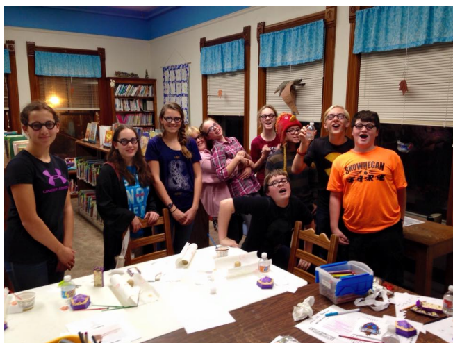
Tween the Pages Book Club members wear "Harry Potter glasses"