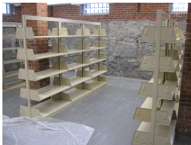
These shelves will soon hold the Library's Genealogy collection