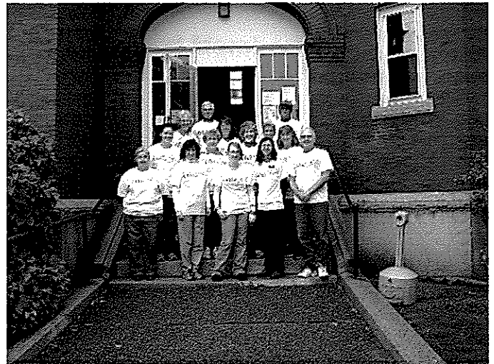
Library Clean-up Day Volunteers

a room in the cellar which will soon be a safe storage facility for our important historical books. I would like to thank all the wonderful volunteers who worked so hard.