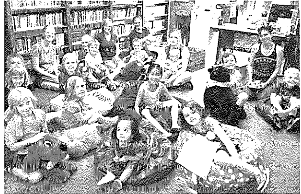
A Wednesday morning Storytime.

If you haven't heard, we are starting a new book club called "Tween the Pages." This is a book club for students in grades 5 -8 and will be meeting on the first Wednesdays of the month at 4:30. We will be starting on September 4 th when all members will receive the first book. If you are interested in joining, just call the library or show up to our first meeting. It should be lots of fun!