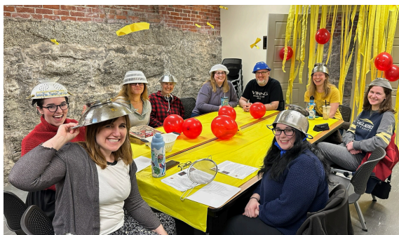
Our BooOOooks in the Basement book club having a spaghetti themed book club. It was a scary good time!

April is a month dedicated to celebrating libraries, and we had a busy one doing what we do best—serving our community and sharing library joy. From Cabin Fever Crafts, to Fly Tying with Skowhegan Outdoors, to Storytime to a Spaghetti themed Book Club to an absolutely incredible Literary Costume Contest, the month was filled with opportunities for connection, creativity, and learning.