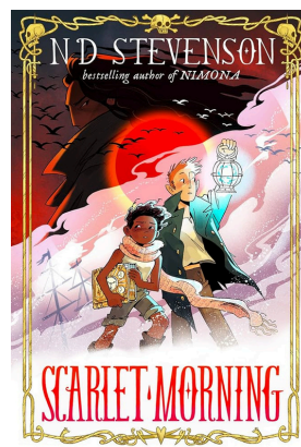
Emily - Scarlet Morning by ND Stevenson