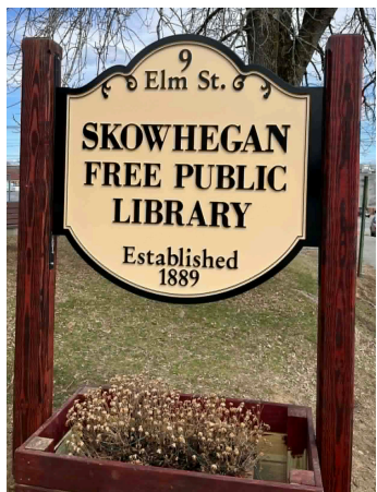
Our beautiful new sign courtesy of York Signs

We hope you will take advantage of this valuable benefit and explore all that your library card has to offer this summer.