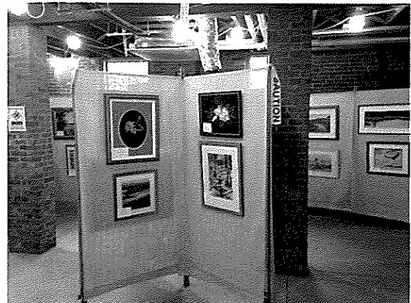
Thirty talented artists submitted their work to make the Art Show a great success.