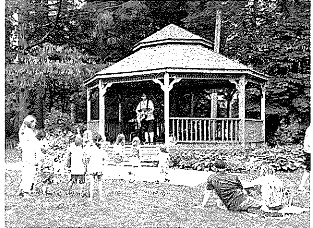
Buster B. concert at Coburn Park was the kick off of our Summer Reading Program.