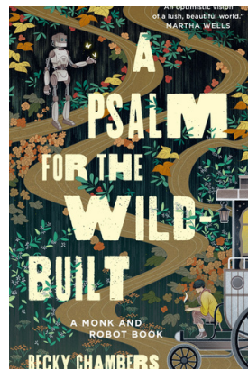
Emily - A Psalm for the Wild Built by Becky Chambers