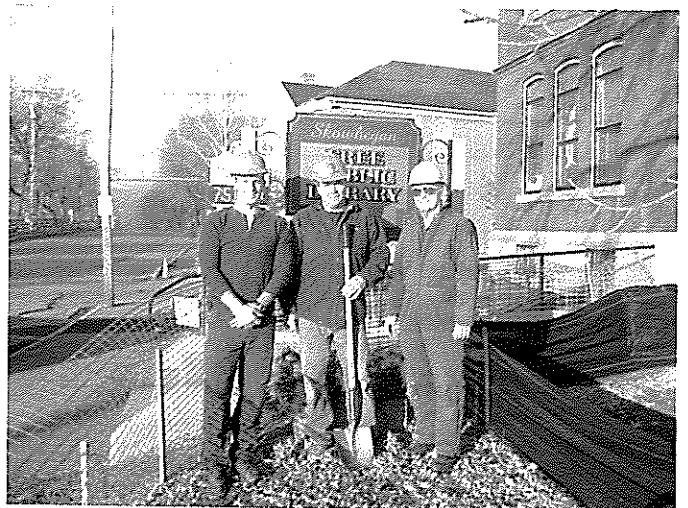
Provençal Plumbers: Three generations at work on the library Renovation Project 2012.