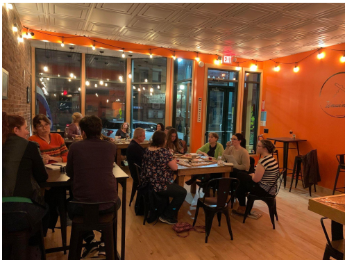
Our first Books & Brews book club meeting was a success!