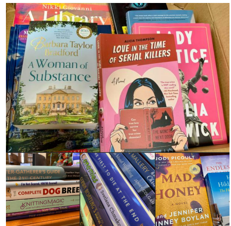
Some of the many books donated during the 2022 Fall Book Drive.

books off our tree or from our online wish list. We appreciate the support and we KNOW that our readers will appreciate the new titles we are able to add to our collection. We will process and catalog them as soon as we can, so be on the lookout for them soon.