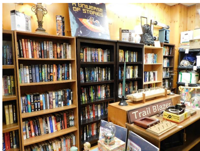
The "Book Room" at the Friends of the Library Shop