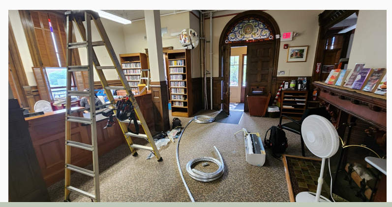
Work on the new HVAC system is still going strong!