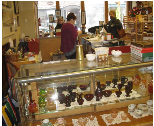
A variety of beautifully displayed items at reasonable prices.