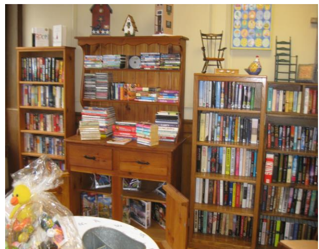
Books and DVDs