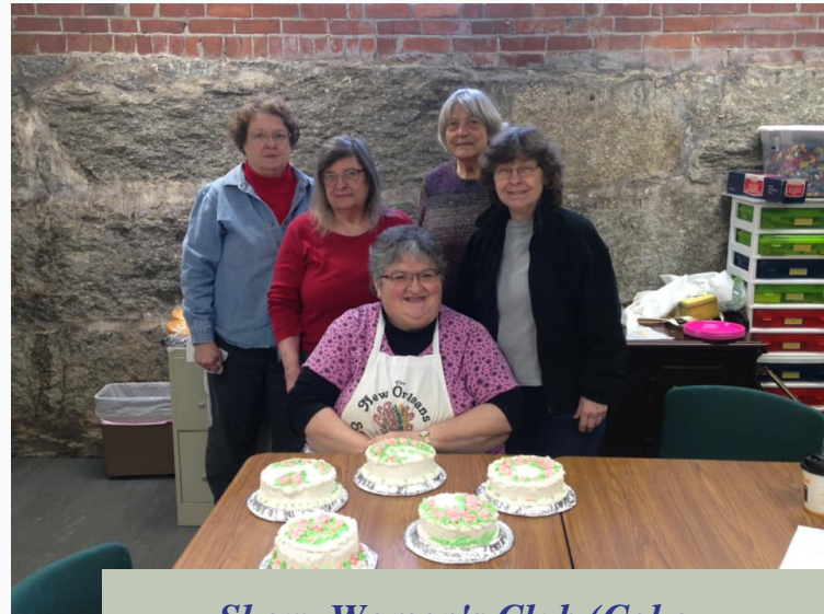
Skow. Women's Club (Cake Decorating Class, Feb. 2020)

Good news though, the Women's Club is back at SFPL and we're hosting a new series of adult craft programs with them over the next few coming months! There will be 1-2 of these events every month through April, with a variety of different crafts or new skills we'd love for you to come try out (think cake decorating, stained glass making, or card embroidery!) Registration is required for these programs, as space and materials are limited, but keep an eye out on our facebook page and our website for more details as they get closer!