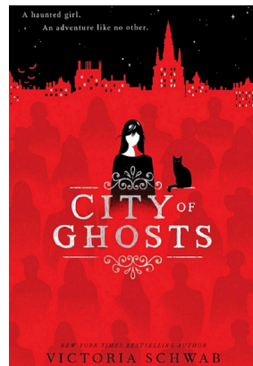
Angie - City of Ghosts by Victoria Schwab