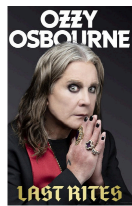
Bree - Last Rites by Ozzy Osbourne