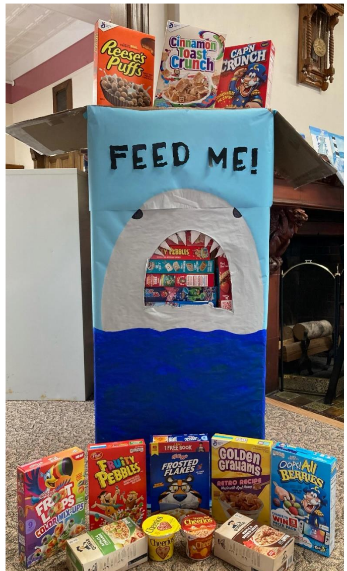
Our very full "sea"real shark, benefiting the Skowhegan Food Backpack Program

to reserve your spot today! Ages 12+ please. As always, we host Sit & Knit every Friday from 1:00 – 3:00! Bring your latest project and knit (or crochet or do some embroidery) here at the library!