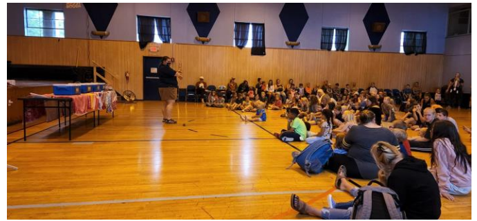
Our last summer reading program of the season, a tide pool presentation put on by Chewonki at The Space on the River!

So now that we are back into the school routine, I just want to remind everybody of our upcoming programming. All school year long, we run Tween the Pages Book Club (for students in grades 7&8); Lego Club (for students in grades 1-6); Preschool Storytime (for all preschool aged children) and STEAM Lab (for students in grades 1-6). Please contact us if you want more information on any of these programs.