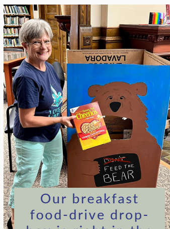
Our breakfast food-drive drop-box is right in the lobby!

We are doing a breakfast "bear" necessities food drive to collect all the breakfast items we can. (This includes cereal, oatmeal, Pop Tarts, granola bars, canned/dried fruit, etc.) Help us FEED THE BEAR all summer long!