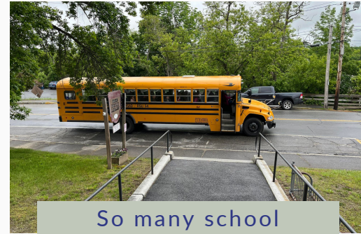
So many school fieldtrips!

June was a busy month for both the library AND the local schools! We had half a dozen fieldtrips just in the first couple weeks of the month, where we gave tours, held storytimes, and went over all the great services and fun programs we offer for kids and families here at SFPL - especially during the summer. It's always wonderful for the staff to meet the new groups of students that get to discover the library in this way, and we always look forward to hosting these fieldtrips in the Spring.